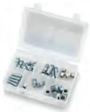
Hose Connector Kit