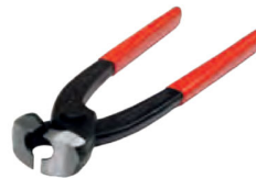
Jubilee® Side Closing 'O' Clip Pincer