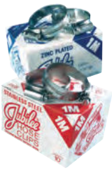
Jubilee® Hose Clips

PCL's hose fittings are designed to complement our vast range of tyre inflation and compressed air products so you can connect your equipment to an existing air line or hose. With the most comprehensive portfolio available on the market, we cover all eventualities, from general maintenance to repairs and emergencies. We also supply an extensive selection of BSP fittings, including male and female adaptors.