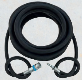
SUPERFLEX HOSE with Standard Adaptor and Vertex Coupling Fittings