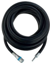
Air Tool Hose Assemblies