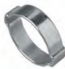
Jubilee® 'O' Clips