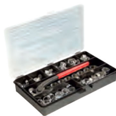
Jubilee® 'O' Clip Kits