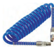
Polyurethane Coiled Air Hose Assemblies