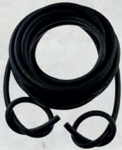
SUPERFLEX HOSE with No End Fittings