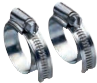
PCL Worm Drive Hose Clips