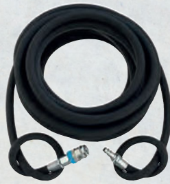
SUPERFLEX HOSE with XF-Euro Fittings