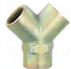
Y Piece Connector