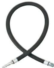
Air Tool Whip Hoses