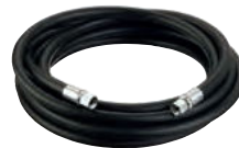
Air Hoses with Swivel End Fittings