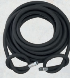
SUPERFLEX HOSE with Rp 1/4 Swivel End Fittings