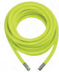
High Visibility Air Hose Assemblies