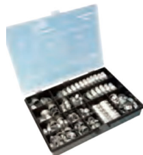
Jubilee® Workshop Pack