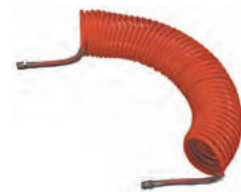
Nylon Coiled Air Hose Assemblies